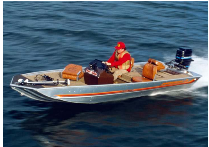
The Bass Tracker revolutionized the industry when it debuted in 1978.