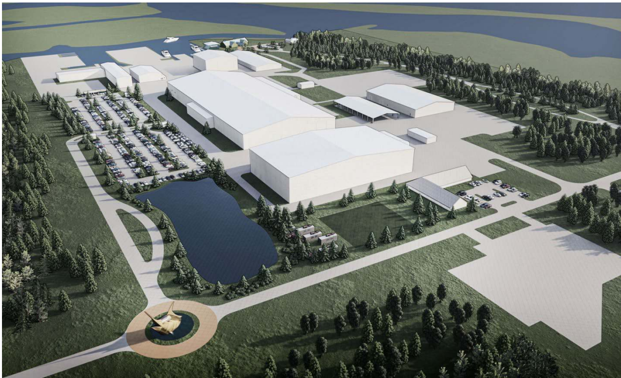
Artist illustration of the new modernized Hatteras plant, which will also become home of iconic MAKO and Ranger Saltwater Series brands right on the Atlantic Ocean.

The addition will shift the focus of the company's saltwater manufacturing from the Midwest to the Atlantic seashore, closer to the saltwater market and a thriving community of craftsmen and women. Importantly, the purchase represents an investment in New Bern, North Carolina's proud history of boat building and the jobs that it sustains. The company will continue to support and grow Hatteras, as well as relocate production of iconic saltwater boat brands MAKO and Ranger Saltwater to New Bern, which is poised to become the new world capital for offshore angling and boating.