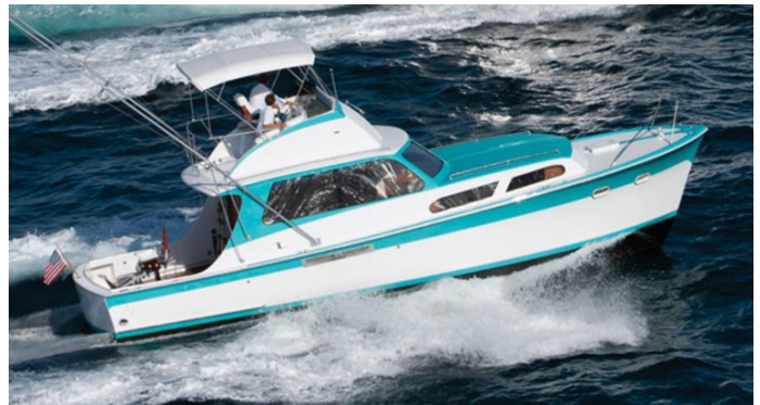
Hatteras legacy dates back to 1960 and its first sportfishing boat, the Knit Wits.