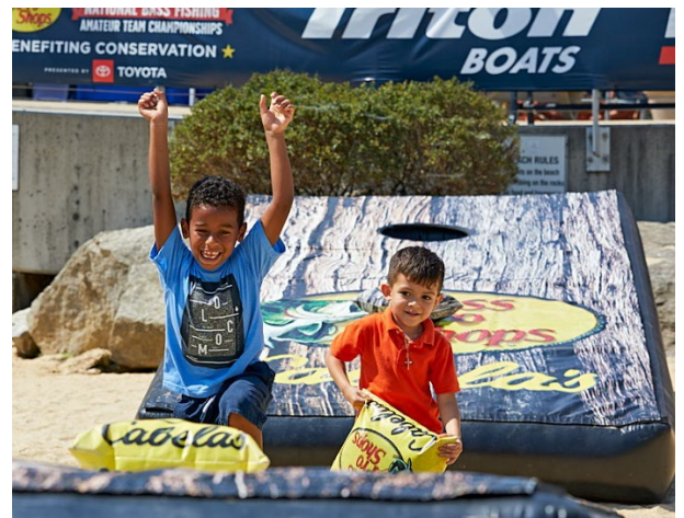
Fans enjoyed free outdoor events and activities designed to help families get excited about the outdoors.