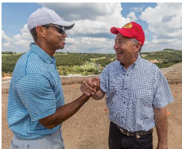
Tiger Woods and Johnny Morris, the team behind Payne's Valley.

Often referred to as the "19 th Wonder of the World," perhaps the most dramatic moment in the Payne's Valley experience was envisioned and designed entirely by Johnny Morris. Those who have had the privilege to play the bonus 19 th hole at Payne's Valley claim that its beauty rivals the world-renowned 7 th hole at Pebble Beach or the 16 th at Augusta. A showcase of the natural heritage of the Ozarks, the 19 th hole provides a unique test of skill that is unlike anything else in the world of golf.