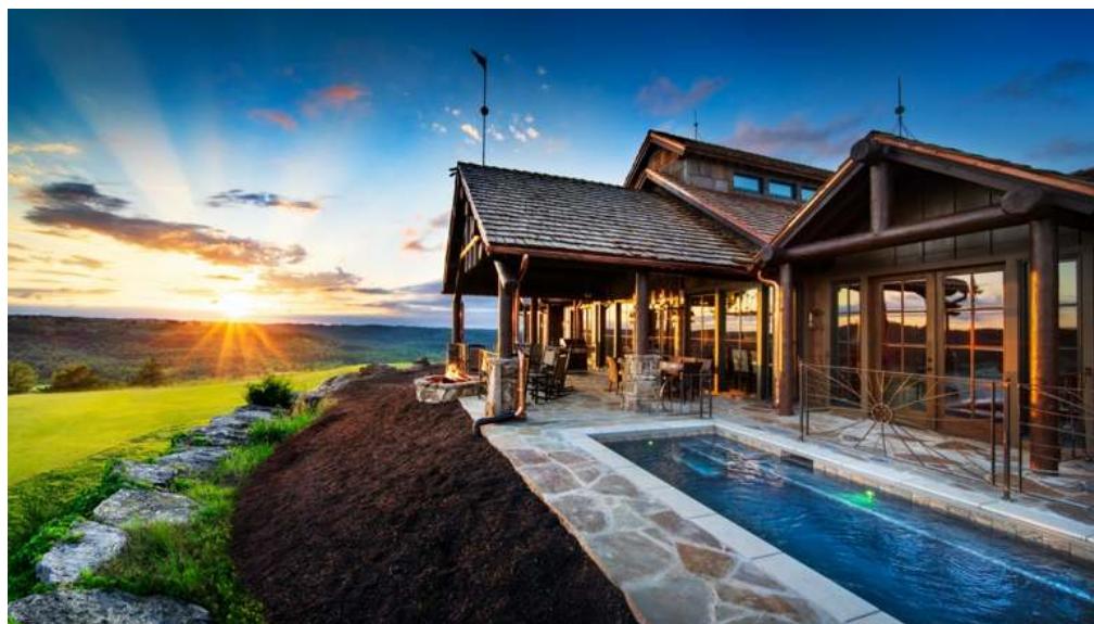
Sunrise at Payne's Valley Cottages.

In process of determining the awards, select members of the esteemed Golf Digest course ranking panel traveled the U.S. and Canada to conduct evaluations of 58 new and newly renovated courses from 2020 and 2021. One panelist said that at Payne's Valley, "the par 3s are beautiful and have some of the course's grandest water features, including lakes, streams and waterfalls along with significant elevation changes."