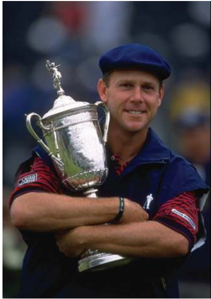
The late Payne Stewart, golf legend and proud son of the Ozarks, with the US Open trophy.

Golfweek's 2020 annual rankings of the "Best Course You Can Play in Missouri." The award for Payne's Valley marks the second time that Golf Digest has recognized a Big Cedar course with Best New Course in North America. Ozarks National was recognized as Golf Digest's Best New Public Course of 2019.