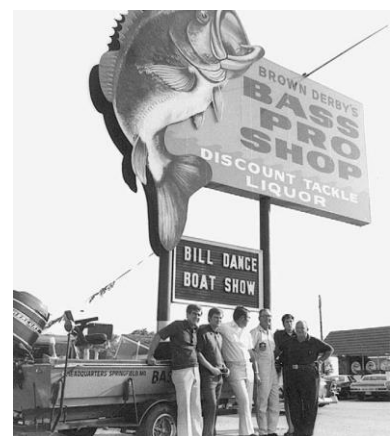
Legendary pro anglers Bill Dance, Johnny Morris and team at the original Bass Pro Shops store grand opening.