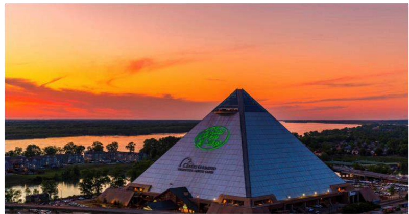
Bass Pro Shops at the iconic Memphis Pyramid stands more than 300 feet tall with a visitor observation deck at its apex.

Bass Pro Shops at the Pyramid, one of the most dynamic, immersive retail experiences in the world , opened in downtown Memphis in 2015. Located along the banks of the Mississippi River, Morris and his team transformed the massive sports arena into a national “must-see” experience for families and outdoor enthusiasts. In addition to a vast assortment of outdoor gear, the Pyramid includes a wilderness-themed hotel called