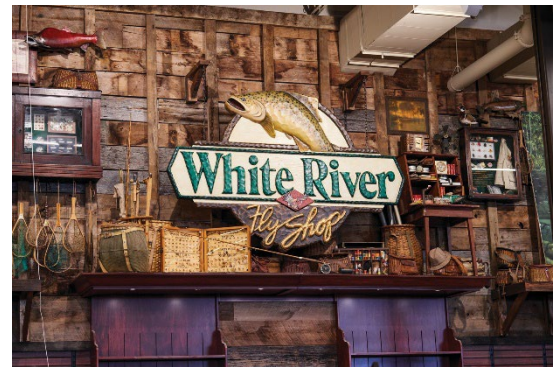
Thousands of historic outdoor artifacts line the walls of this 93,000 sq. ft. immersive destination retail store.

Approximately 145 Outfitters will deliver quality customer service to outdoor enthusiasts in the St. Louis area. In addition, the store will offer free events, outdoor skills workshops, educational seminars and demonstrations throughout the year for adults, kids and families that will help maximize outdoor fun by teaching new skills and improving existing ones.