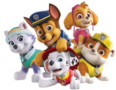
PAW Patrol characters will make appearance at grand opening celebration

Following the grand opening ceremony, these personalities will be available for meet and greet opportunities and autographs. PAW Patrol characters also will be onsite to meet and take photos with kids and families.