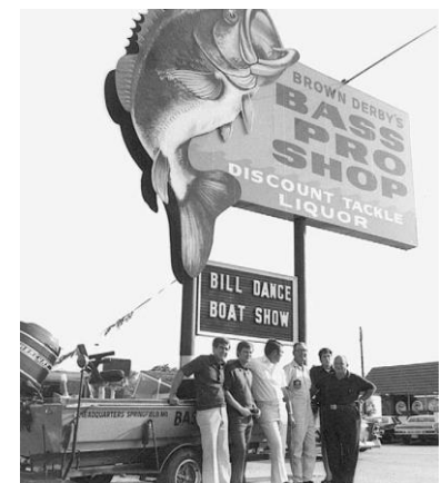
Legendary pro anglers Bill Dance, Johnny Morris and team at the original Bass Pro Shops store grand opening.