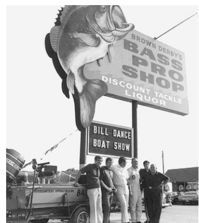
Legendary pro anglers Bill Dance, Johnny Morris and team at the original Bass Pro Shops store grand opening.