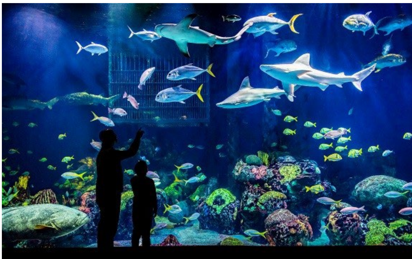
Guests can plunge to the depths of the ocean floor and admire dozens of reefs and live aquatic animals including diving with sharks

This poll ranks the top 20 prominent institutions across North America, highlighting the best of the best when it comes to attractions for conservation-minded guests of all ages. WOW was nominated for the competition by a panel of nationally respected travel experts as part of USA Today's annual Readers' Choice Awards. To determine a winner, members of the public across the United States were invited to cast their vote.