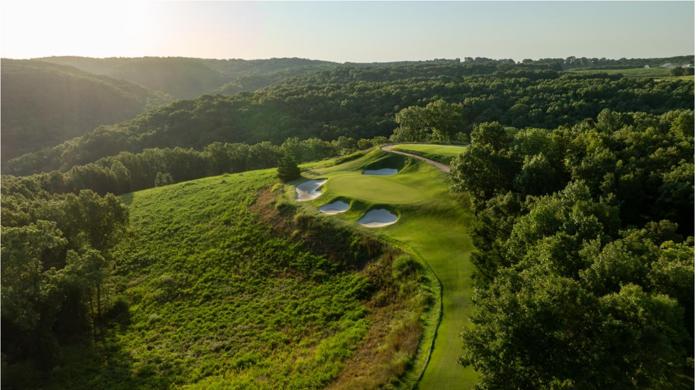
Ozarks National, designed by the renowned firm Coore & Crenshaw Named #1 Best New Course in America by Golf Digest when it opened in 2019

It is by creating these kinds of unforgettable memories that Big Cedar Lodge was able to rise past so many other notable golf resorts to take over the No. 1 spot in the USA Today competition.