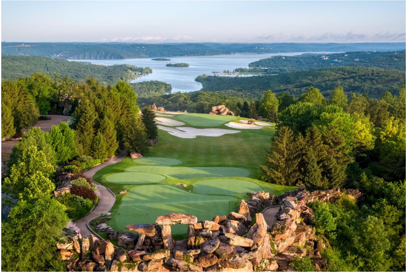
Top of the Rock by Jack Nicklaus The only par-3 course to host PGA sanctioned events

Not to be outdone, another legend, Gary Player, built the 13-hole Mountain Top par-3 course, pictured below at sunset and as its name implies, the elevated setting, sweeping views and nature are paramount.