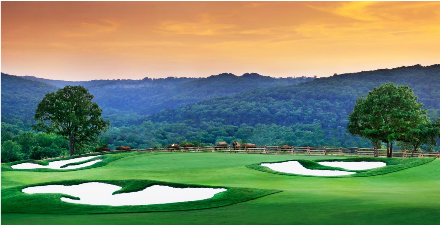
Buffalo Ridge by Tom Fazio