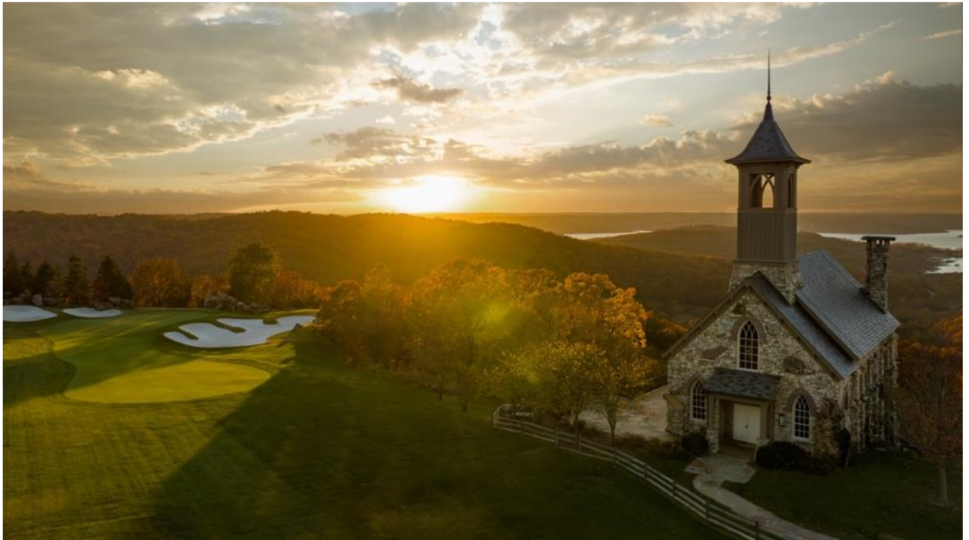
Legendary Top of the Rock