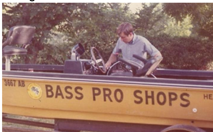
Bass Pro Shops founder Johnny Morris preparing for a bass fishing tournament in the early 1970s

Bass Pro Shops and Hobie were both born out of humble beginnings. Johnny Morris started Bass Pro Shops from just an 8-square-foot space in the back of his father's liquor store in Springfield, Missouri, in 1972. Six years later, in 1978, Johnny revolutionized the marine industry when he introduced the BASS TRACKER®, the first-ever nationally marketed pre-rigged boat, motor and trailer package. Johnny made this complete package with everything anglers needed available at the remarkable affordable price of only $2,995. BASS TRACKER was like the Model T of fishing boats, offering unmatched quality and value. Overnight, owning a boat became more affordable than ever and TRACKER quickly became and has remained the world's best-selling fishing boat for the last 47 years running.